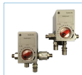
High/Low Air-Oxygen Mixer