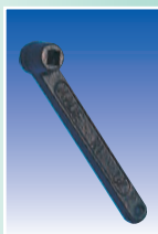
6150/5 (Pack of 5)