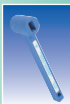
6157/5 (Pack of 5)