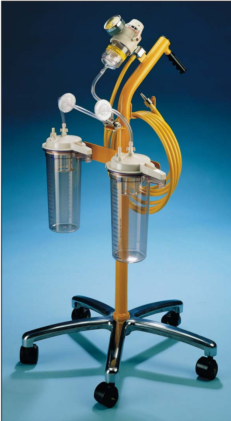
THEATRE SUCTION UNIT - PART No. 4760

A STURDY 3 FOOT TROLLEY WITH 5 CASTOR BASE COMPLETE WITH ANGLED HIGH SUCTION CONTROLLER