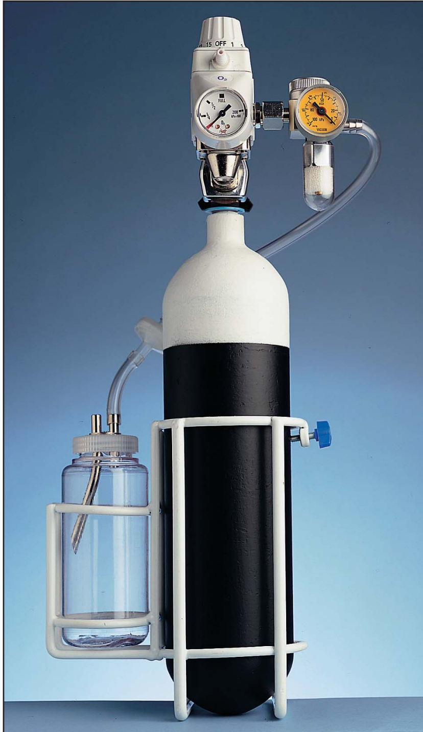
TEK 2000 EMERGENCY KIT - PART No. 4475

A PORTABLE SUCTION AND O 2 THERAPY KIT RUN FROM A GAS CYLINDER