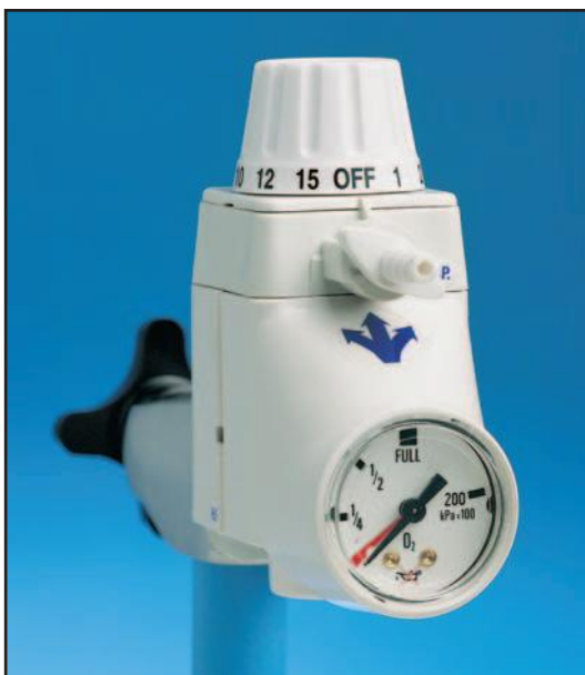
DIALREG - O2 - BULLNOSE PART No. 5050 PIN INDEX PART No. 5055