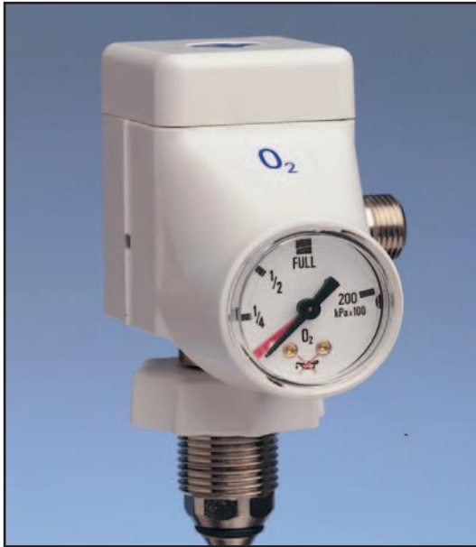
MEDIREG - O2 - BULLNOSE PART No. 5000 PIN INDEX PART No. 5005