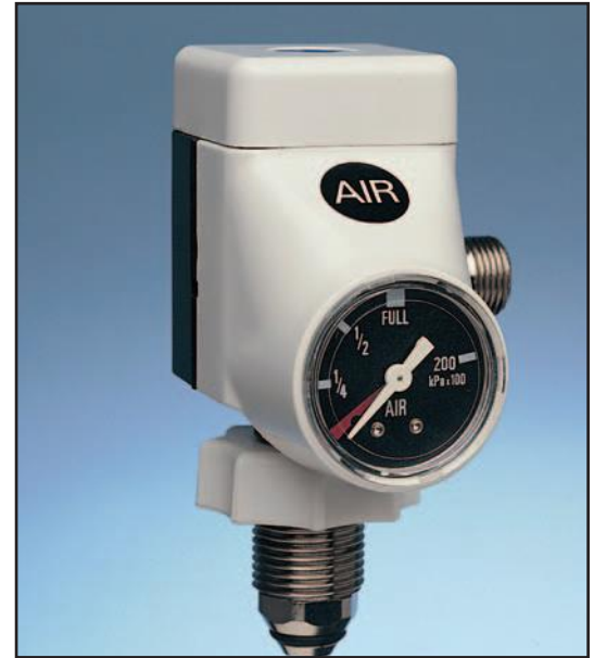
MEDIREG - AIR - BULLNOSE PART No. 5010 PIN INDEX PART No. 5015