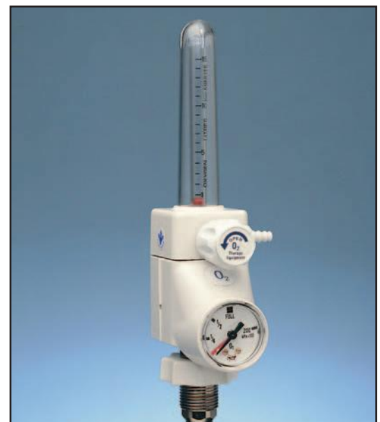
FLOWREG - O2 - BULLNOSE PART No. 5150 PIN INDEX PART No. 5152